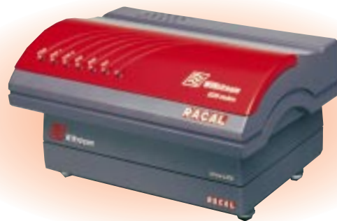
Voice UPS provides backup power to analog ports. WINstream mounts conveniently on top.

The WINstream modem converts the async PPP protocol received from a PC into sync PPP for transmission over the ISDN link. This feature allows the unit to connect directly to a far-end ISDN router or other ISDN device running sync PPP, eliminating the need for a far-end ISDN modem.